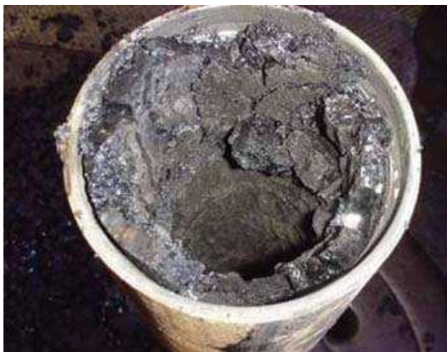
Fig. S1: Clogging of the pipeline due to asphaltene deposition. [3]