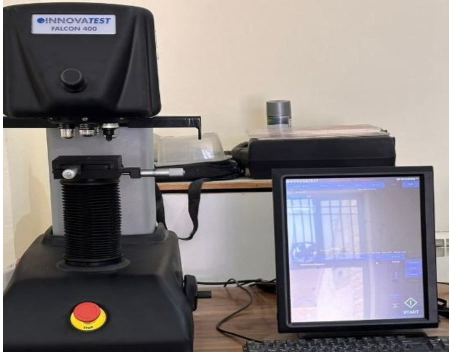
Fig. S2: Digital microhardness tester (Falcon 400).

Publisher’s Note: Engineered Science Publisher remains neutral with regard to jurisdictional claims in published maps and institutional affiliations.